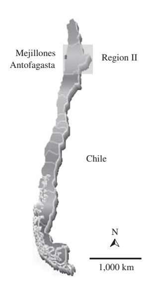
Figure 1. Map of Chile showing the locations of the study cities, Antofagasta and Mejillones, in region II.

from the city's only water source until 1970, with over 10 times more people being exposed to high arsenic concentrations than in any other study. Since there was no other water source, all residents were exposed to the same high level of arsenic. This scenario, with its distinct high-exposure period (1958–1970), large population, good exposure records, and appropriate latency period, provided us with a unique opportunity to investigate the long-term consequences of arsenic exposure (13).